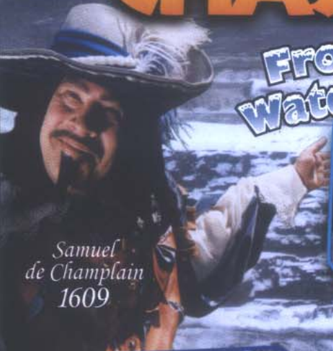
Samuel de Champlain 1609