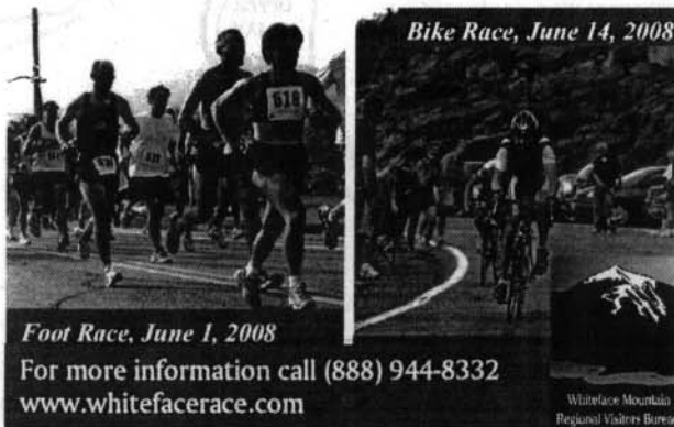
Foot Race, June 1, 2008