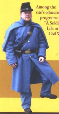
Among the site's educational programs is "A Soldier's Life in The Civil War."

115 John Brown Road Lake Placid, NY 12946