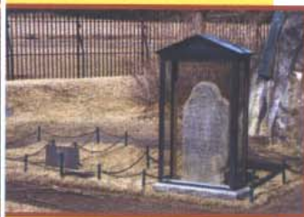
The remains of John Brown's sons and followers killed in the Harper's Ferry raid were also interred in the graveyard.