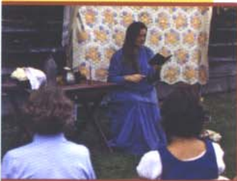
Special events are offered throughout the visitor season.

John Brown Farm is located 2 miles east of Lake Placid and 1/2 of a mile north of Route 73 on John Brown Road.